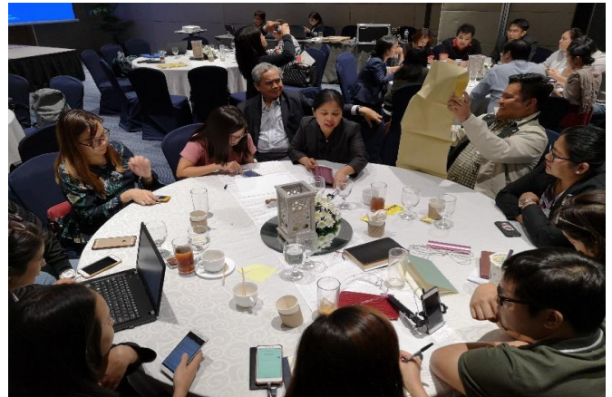
A Forum on Understanding Risk and Resilience attended by National Government Agency officials, Academe, Non-Government Organizations (NGOs) in celebration of the Oct 12 International Day for Disaster Reduction

ARISE Philippines will support and engage local business communities and governments to increase awareness of and understanding for improving disaster resilience in the urban and built environment. It will address critical infrastructure and basic service delivery, transportation, energy and utilities services, and undertake informed risk-sensitive planning and facilitate public-private partnerships (PPP) and collaboration to address gaps in disaster risk management to meet Theme 6: Urban Risk Reduction.