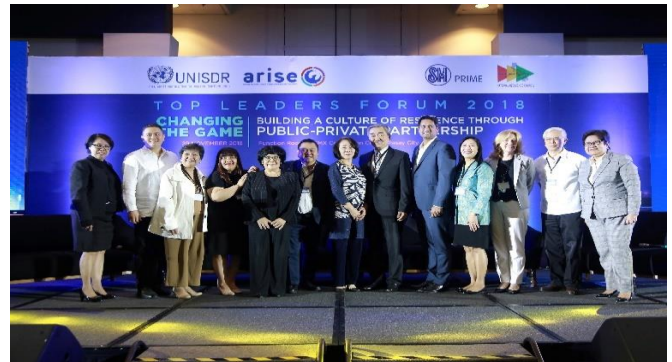
The National Resilience Council's (NRC) Local Government Units (LGUs) partners during the 2018 Top Leaders Forum.