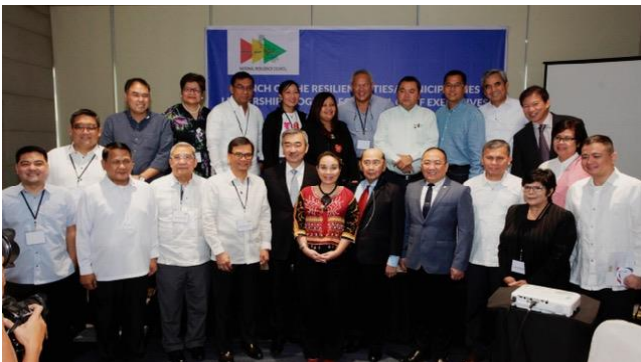
Sen. Loren B. Legarda, together with national and local government officials, during the launch of the Resilient Cities/Municipalities Leadership Program for Local Chief Executives