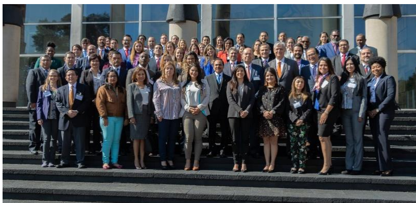
Image 1: Inaugural Session of the VII SELA Encounter for Public-Private Alliances

ARISE MX was launched on 22 November during the event VII Encounter for Public and Private Alliances to Reduce Disaster Risks in Latin America and the Caribbean. This event was held with the partnership of SELA, BMZ, CISS, UNISDR-Americas and the Caribbean and CEMEX, with the attendance of 70 regional participants.